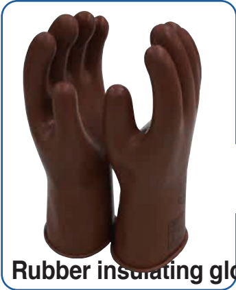
Rubber insulating gloves

Personal protective Equipment, made in Japan