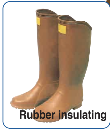
Rubber insulating boots