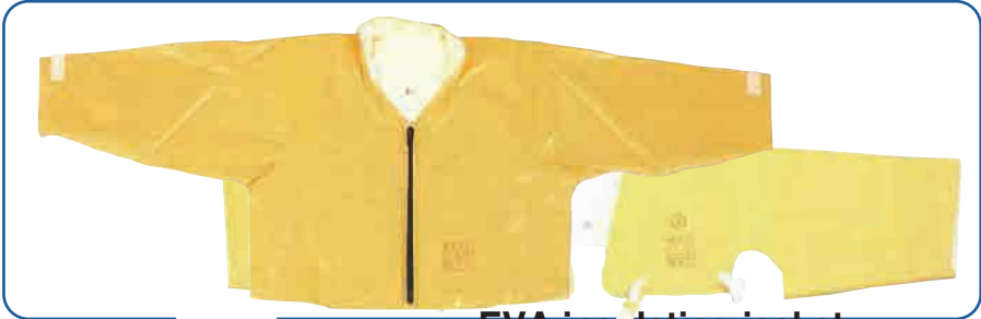
EVA insulating jacket